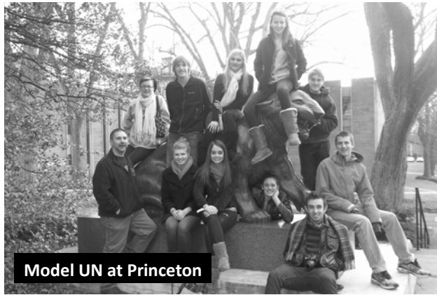
Model UN at Princeton

Faculty is recognized regionally and nationally for scholarship and excellence through fellowships, museums, national conferences, scholarships, and consultants to national textbook publishers