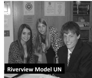
Riverview Model UN