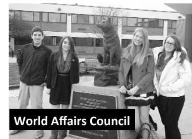
World Affairs Council