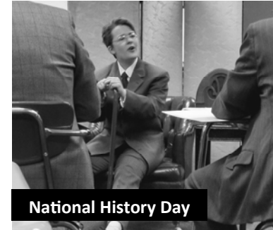
National History Day