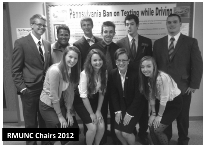
RMUNC Chairs 2012

Upon entering ninth grade, students can join the Riverview History Club. This club is the main sponsor for the National History Day team and Model United Nations team. Students on this team have earned national recognition at national competitions and Model United Nations Conferences at esteemed universities such as Yale, Princeton, Columbia, and Johns Hopkins.